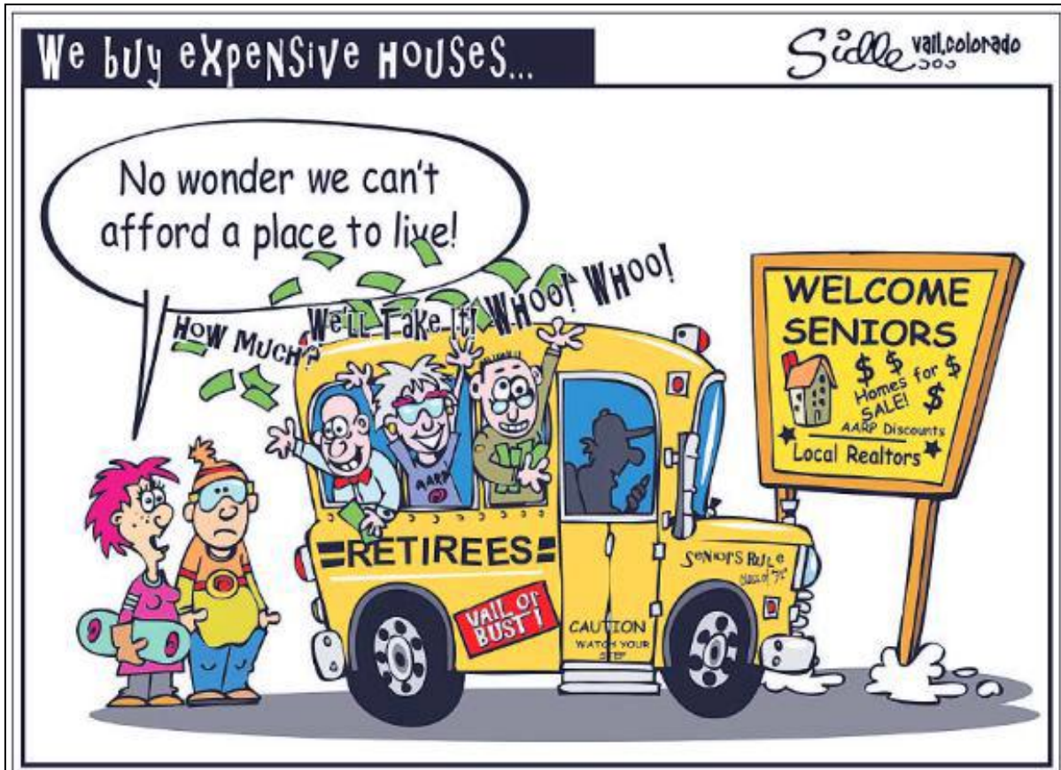
Vail Daily cartoon (03/08/18) responding to the findings of a national report.